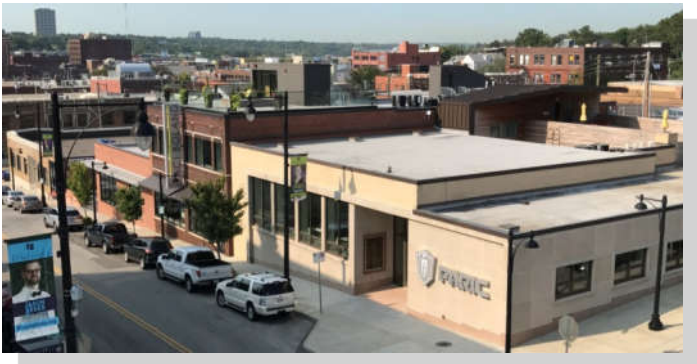
Film Row Office Building Renovations at 17 th & Wyandotte – 2014-2017

“We chose Lacy & Company because of the highest possible recommendation from two separate sources. For me they are set apart from other consultants by my absolute trust in them.”