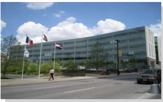
JE Dunn National Headquarters 2006-2009

Lacy & Company can also help with feasibility studies, RFQ/RFP selection processes, furniture and equipment procurement, operating cost projections, board presentations, development incentive assistance, LEED certification, or other individual services that may be desired. Projects we manage for clients are highly organized and are completed on time and within budget. We add significant value, especially when retained early during initial planning. Savings are generally realized by the Owner significantly in excess of our fees.