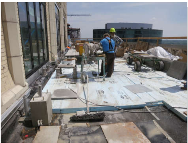
The Baltimore Club – Kansas City, Mo.

Each month during construction, Lacy & Company prepares a thorough written report to the bank describing our findings and listing any discrepancies that should be resolved prior to the release of funds. Our reports are completed in a timely and professional manner, and our services are cost efficient.