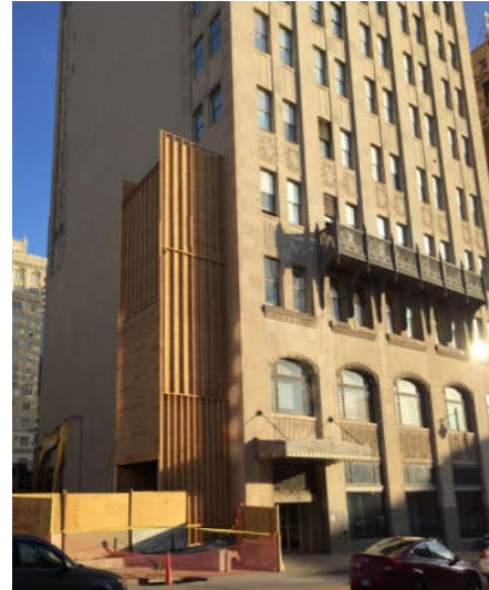
Power & Light Building Apartments Kansas City, MO

Each month during construction, Lacy & Company prepares a thorough written report to the bank describing our findings and listing any discrepancies that should be resolved prior to the release of funds. Our reports are completed in a timely and professional manner, and our services are cost efficient.