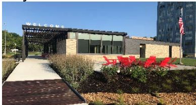
St. Andrew's Episcopal Church HJ's Community Center

6,000 SF Community Center Building In Brookside Neighborhood Year Completed: 2018 Value: $2,500,000 Architect: DRAW Architecture Contractor: Centric Projects