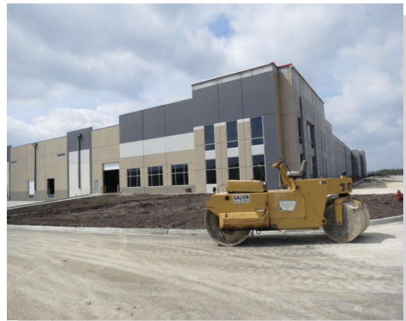
Logistics Park KC – Edgerton, KS