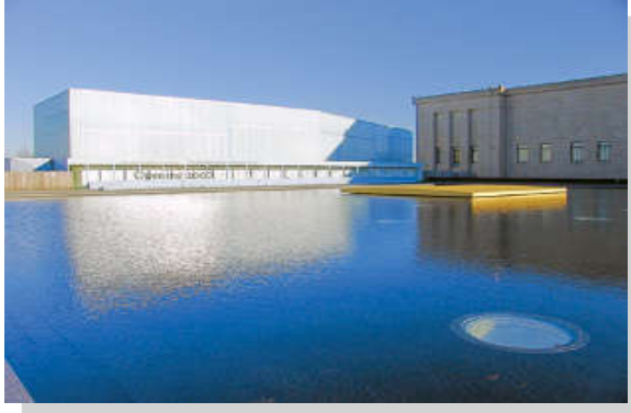
The Nelson-Atkins Museum of Art Bloch Building Expansion / Renovations 1999 - 2007

Lacy & Company was founded in 1972 and has successfully provided a wide range of real estate and construction related services. Company principals have personal involvement in every engagement from start to finish, and our clients gain an experienced partner who persistently advocates for their best interests. Lacy & Company maintains strong relationships with local civic and industry leaders and is dedicated to improving the cultural and economic growth of our metropolitan area.