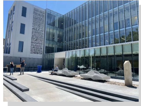
Rockhurst University – Sedgwick Hall

Owner Representation is often referred to as Program Management or Development Management. It is the comprehensive oversight of a development or construction project on the Owner's behalf. Hiring an effective Owner's Representative saves the Owner time and money, and results in a higher quality, more functional, and more efficient building. Lacy & Company's Owner Representation services generally encompass the following: