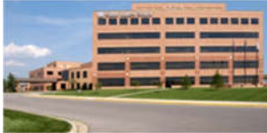
Saint Luke's South Medical Office Building

100,000 SF Medical Office Building Year Completed: 1998 Value: $15 million Architect: Architectural Consultants, Inc. Contractor: JE Dunn Construction