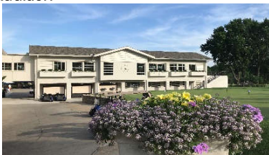
Mission Hills Country Club Renovations / Fitness Addition

17,000 SF Renovation and Addition 2 Story Fitness Addition / Pool Pavilion Bldg. Year Completed: 2017 Value: $6,500,000 Architect: Gastinger Walker & Contractor: Centric Projects